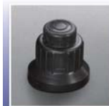
Sure-Lite™ Electronic Ignition System