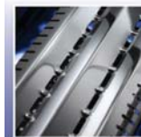
Stainless Steel Flav-R-Wave™ Cooking System