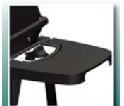
Durable Resin Side Shelves