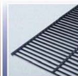
Cast Iron Cooking Grid